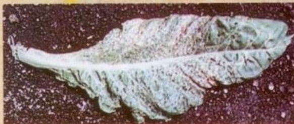
Tobacco streak virus

A number of viruses infest tobacco resulting in the production of poor quality leaf. Insects are known to be the main vectors transmitting these viruses during their feeding from one crop to another and from one season to another. Tobacco viral diseases like Tobacco Bushy Top Virus, Tobacco Leaf Curl Virus (TLCV) and Tomato Spotted Wilt Virus (TSWV) are predominantly transmitted by insect vectors whitefly ( Bemisia tabaci ) and thrips respectively. Thrips also transmit Tobacco Streak Virus.